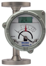
MT3809 Series Metal Tube VA Flow Meters