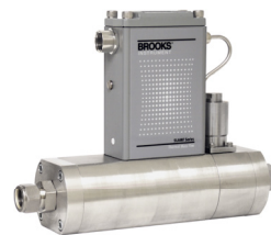
SLAMf Series NEMA 4X/IP66 Thermal MFCs

Extremely reliable, accurate and repeatable measurement and control for demanding industrial processes.