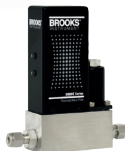
5850E & i Series Analog Thermal MFCs

Multiple gases and flows in one device maximizes process flexibility and productivity while preserving accuracy, all in a compact footprint.