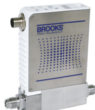
Metal Sealed Pressure Controllers

Ultra-fast response time and high-purity all-metal flow path minimizes contamination, enhances yield.