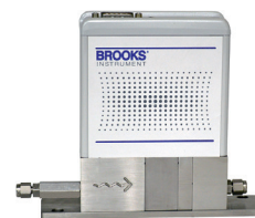
Quantim® Coriolis MFCs

Maximize process results through stable pressure control and enhanced process gas purity.