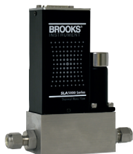
SLA Series Elastomer Sealed Pressure Controllers

Eliminate droop and hysteresis through closed loop control utilizing the core technology in our thermal MFCs.