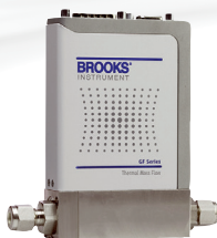
GF40 Series MultiFlo™ Thermal MFCs

Proven MFC for widest range of mass flow needs and applications delivers superior results and lower total cost of ownership.