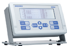
0250 Series Four Channel Power Supply, Readout & Set Point Controller