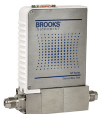
Metal Sealed Thermal MFCs

Eliminate droop and hysteresis through closed loop control utilizing the core technology in our thermal MFCs.