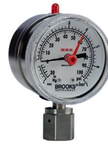
Mechanical Pressure Gauges, Switches & Transmitters