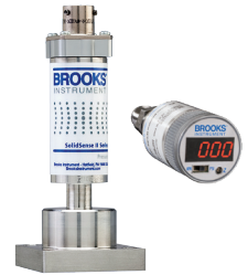
SolidSense II ® Pressure Transducers

Widest temperature, pressure and flow ranges for measuring fluids in hazardous, remote areas.