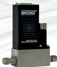
SLA Series General Purpose Thermal MFCs

Proven MFC for widest range of mass flow needs and applications delivers superior results and lower total cost of ownership.