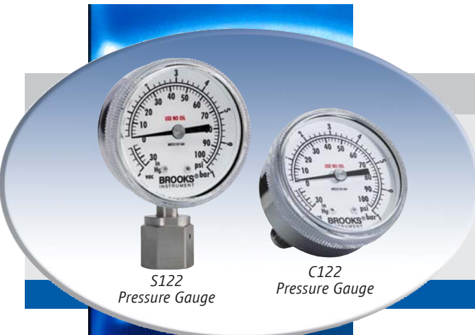
S122 Pressure Gauge